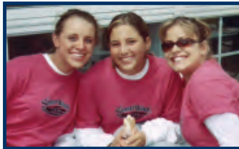
14th ANNUAL SPIRIT WALK, 2004