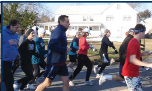
6th ANNUAL TURKEY TROT