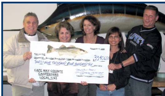
2nd ANNUAL HIGH TIDES STRIPER TOURNAMENT