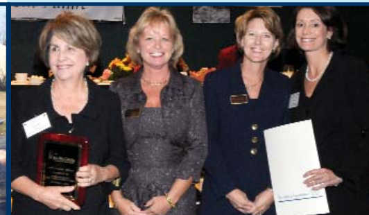
CHAMBER OF COMMERCE AWARD

For the most up-to-date information, call 609-967-0100 or Visit our website www.brendansfund.org for all the latest information and entry forms for the events. We hope to see you throughout the year!